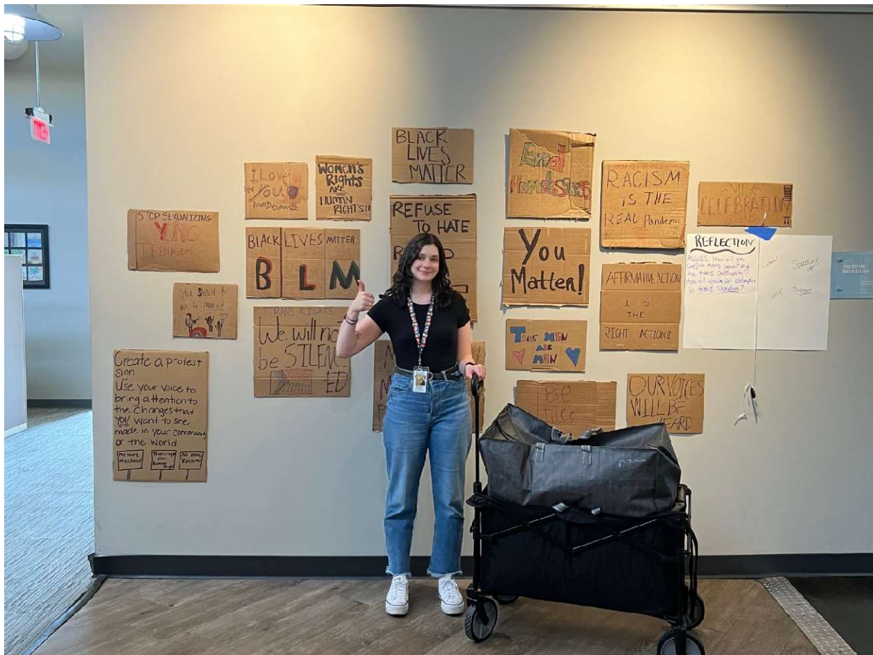
Great job EPC – 159 Goody Bags assembled!

2:202 – 5:20 P.M. Volunteers will hand out glasses, clean-up, lift and empty buckets, and give out wristbands. Many roles involve standing and can be made accessible for sitting as needed.