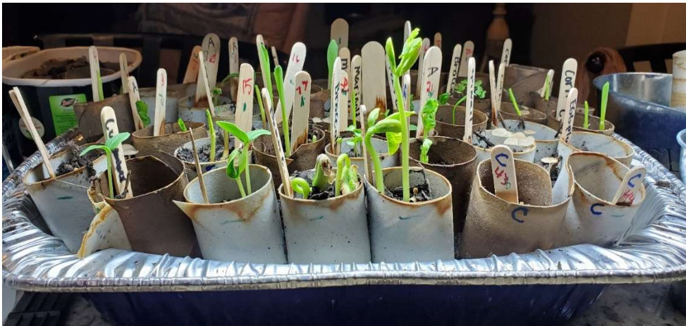
Mixed vegetable seeding – week 3