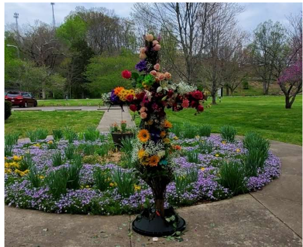
2022 Easter Cross

We will have a cross outside the front entrance of the church. Please bring flowers to help decorate it as we celebrate the resurrection of Christ from his earthly grave. It is covered with wire so you can easily weave your flower stems through to secure them in place. They can be from your yard, from the side of the road, or from the local grocery or florist. Yay, it is a glorious day. We will take pictures of you by the cross after service if you wish.