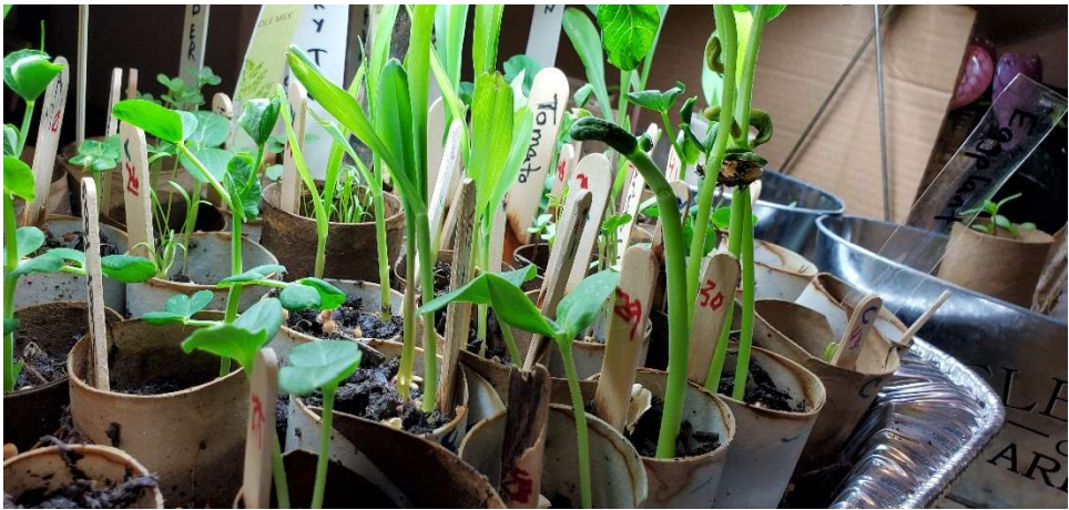
Mixed vegetable seeding – week 4