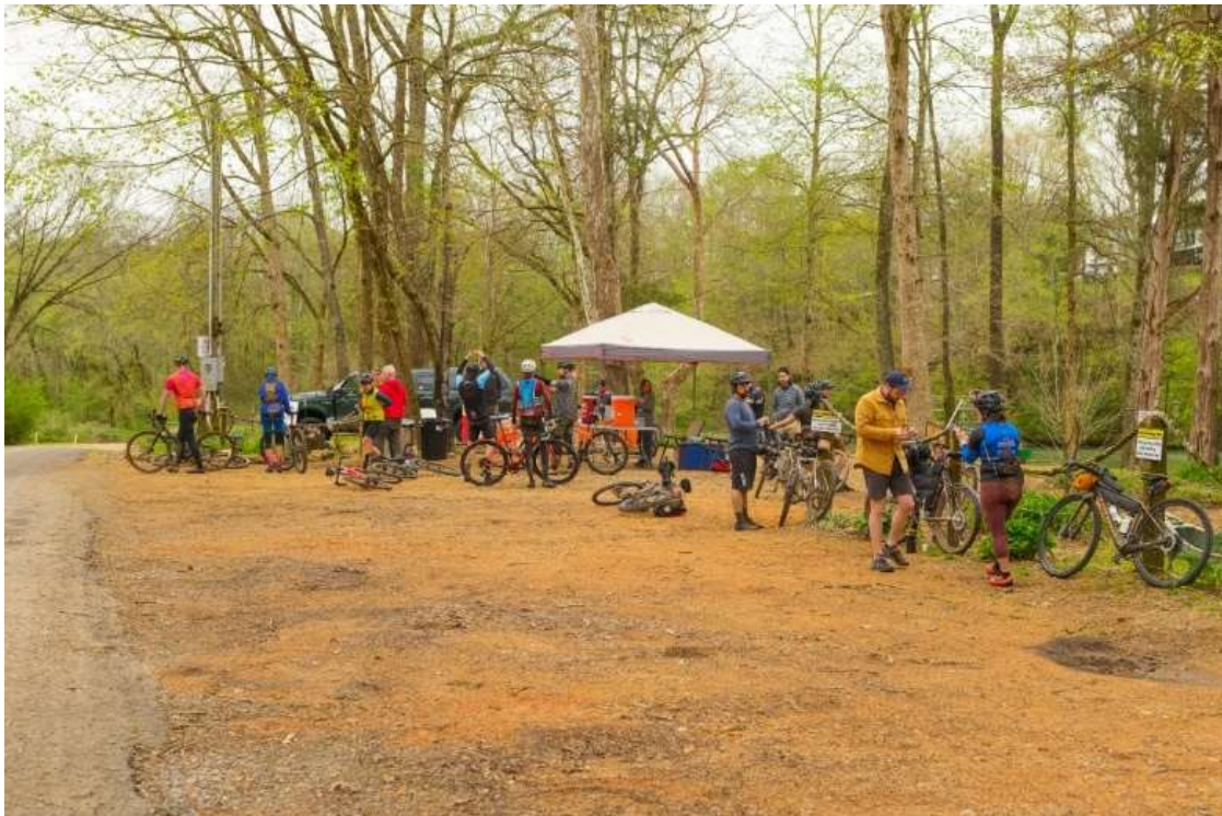
Bike check-in and rider registration

Saturday 3/30/24 ...This three-day gravel cycling event in Hickman County, TN is back for the seventh year with proceeds benefiting Oasis Bike Workshop! Volunteers will receive an event t-shirt, post-ride meal, and non-transferable free entry to next year's even. They are also welcome to camp out on Friday or Saturday night. Tasks range from greeters, and registration help, to bonfire keepers and aid station volunteers. Use this link for more information and click the contact button: www.oasisbikeworkshop.org