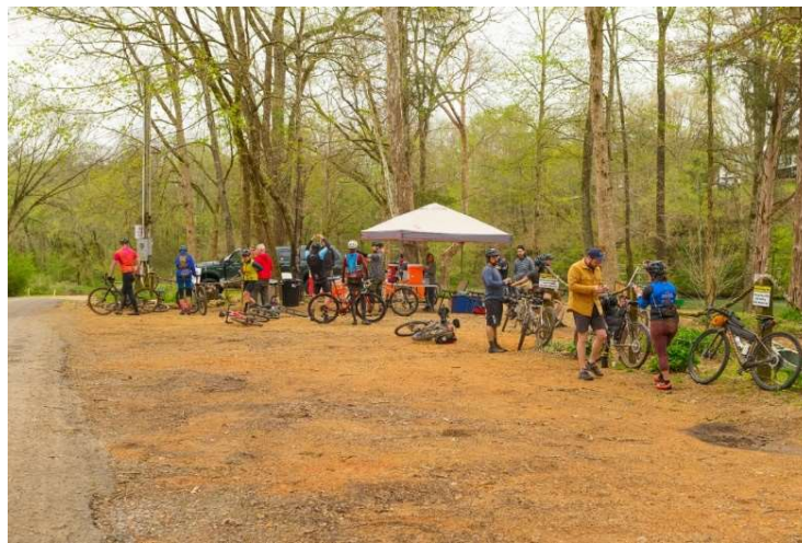
Bike check-in and rider registration

Saturday 3/30/24 ...This three-day gravel cycling event in Hickman County, TN is back for the seventh year with proceeds benefiting Oasis Bike Workshop! Volunteers will receive an event t-shirt, post-ride meal, and non-transferable free entry to next year's even. They are also welcome to camp out on Friday or Saturday night. Tasks range from greeters, and registration help, to bonfire keepers and aid station volunteers. Use this link for more information and click the contact button: www.oasisbikeworkshop.org