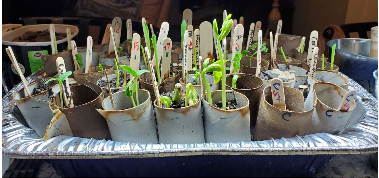
Mixed vegetable seeding – week 2