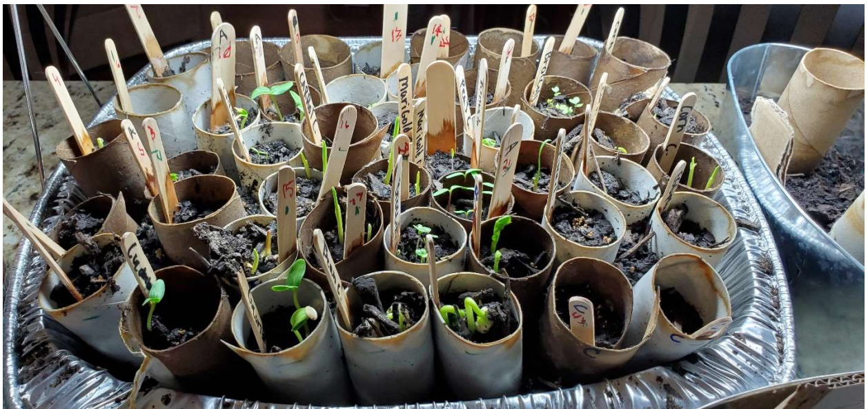
Mixed vegetable seeding – week 1

Success! Elizabeth's tiny little tomato sprout. I bet it will produce the best tasting ones you ever ate! It will go in the garden after temps are consistently warmer.